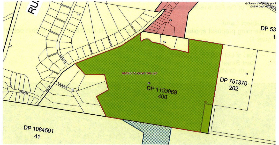
Figure 2 - Existing Zoning Plan – Grafton LEP 1988

The subject land is zoned 6(b) (Recreation (Special Purposes) zone under the Grafton LEP 1988 (refer to Figure 2, below). The 6(b) zone prohibits the erection of dwelling-houses (except ancillary dwellings), and subdivision for such development. Hence, current lot potential for housing is nil.