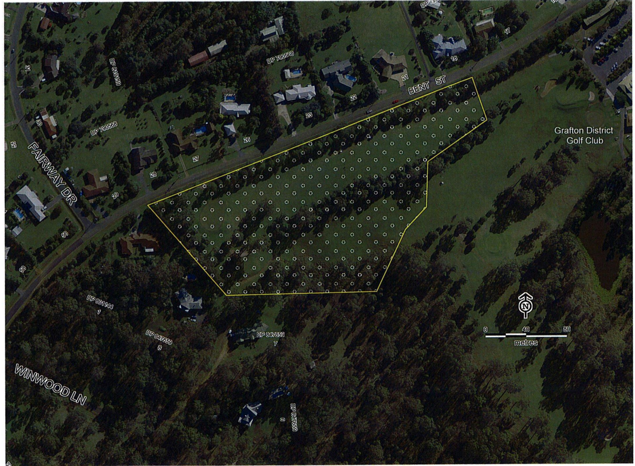
Figure 1 - Locality Sketch

Part of Lot 400 DP 1153969 Bent Street South Grafton